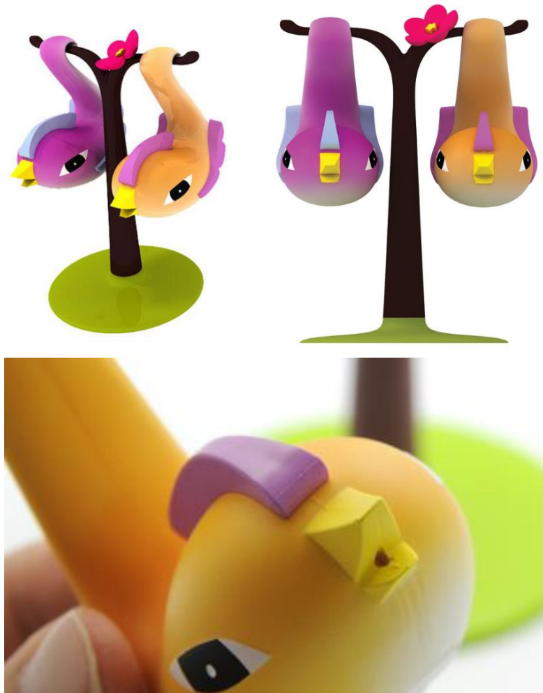
Paradise Birds Salt and Pepper , designed by Giovannoni Stefano for Alessi

Cast in resin and hand decorated dimensions: length:12cm, width:9cm, height: 14cm