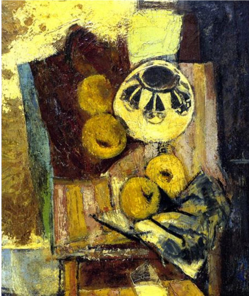
Cubist Still life with Ceramic Bowl and Apples (1927) by Alfred Henry Maurer Oil on canvas