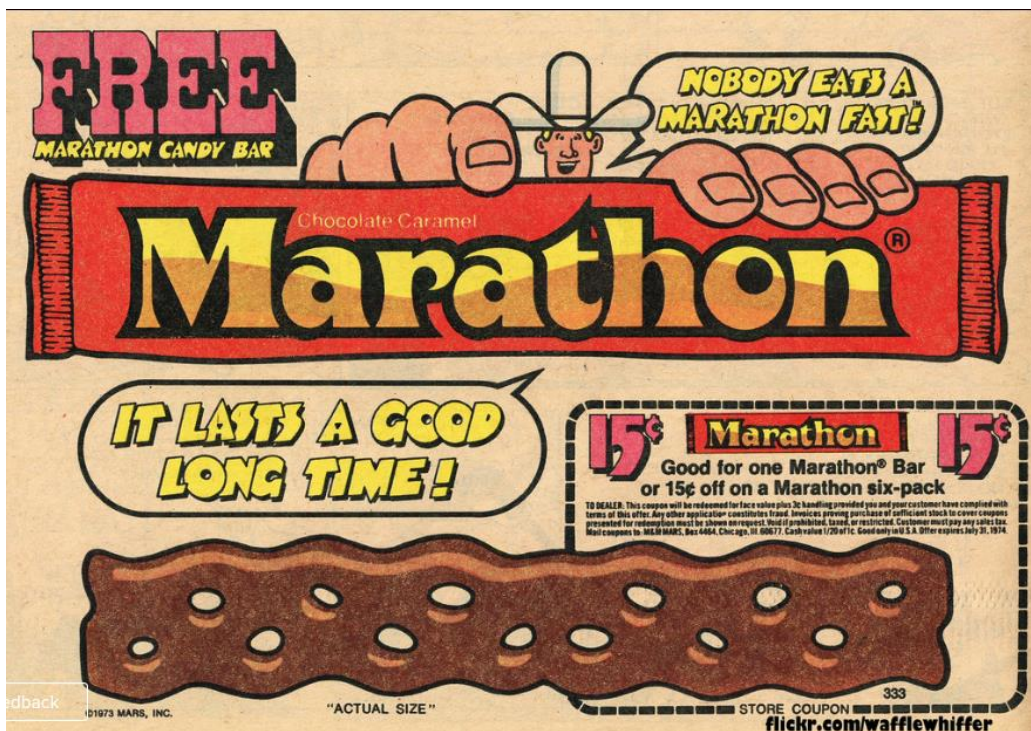
Newspaper advertisement for 'Marathon' candy bar, 1973

6. Graphic designers often have to create visual impact and communicate a message. Comment on the methods used by this designer in this newspaper advert for Marathon candy bars. In your answer refer to: