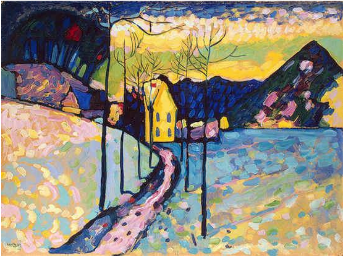
Winter Landscape I, Kochel, Bavaria (1909) by Wassily Kandinsky Oil on cardboard (71.5 x 97.5 cm)