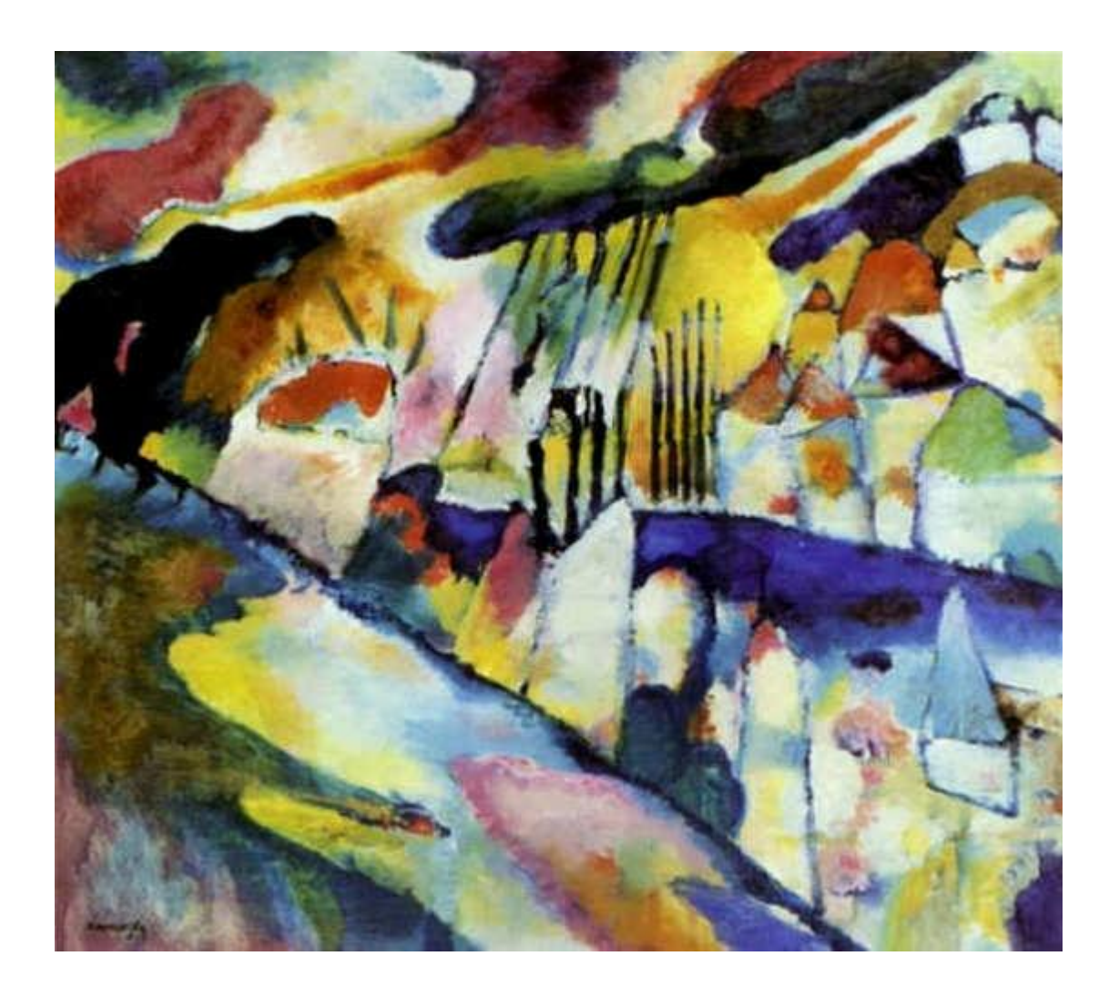
Wassily Kandinsky. 'Landscape with Rain'. 1913