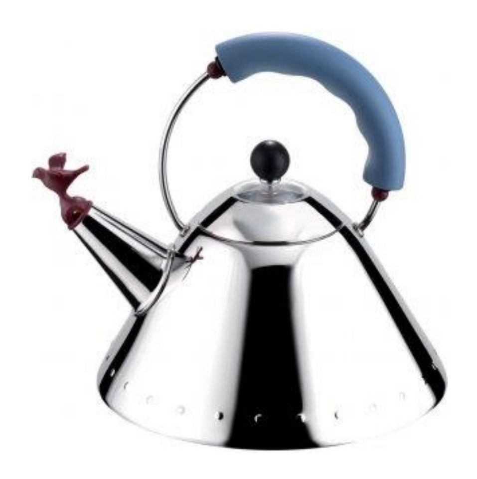
Alessi 'Kettle with Bird Whistle (1985) designed by Michael Graves Materials: Stainless steel